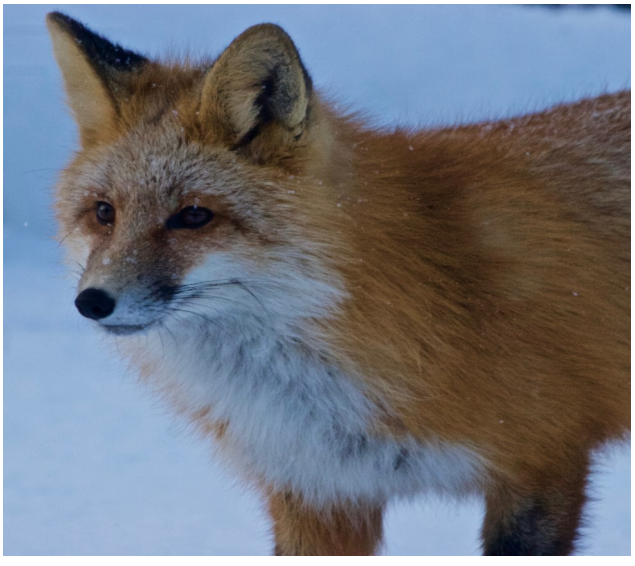
fox; red fox: naaGas'éi