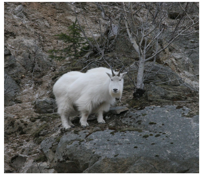
mountain goat; jánwu